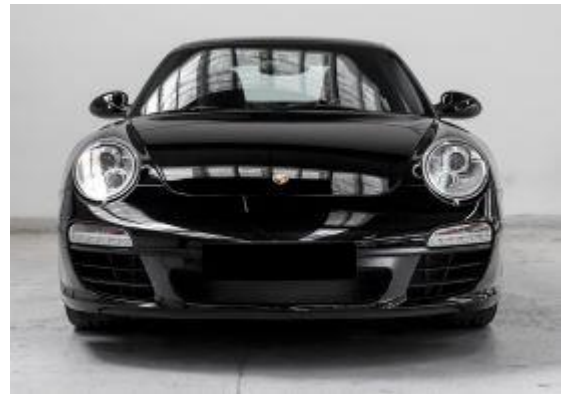
997 Carrera S 2004 - 2008