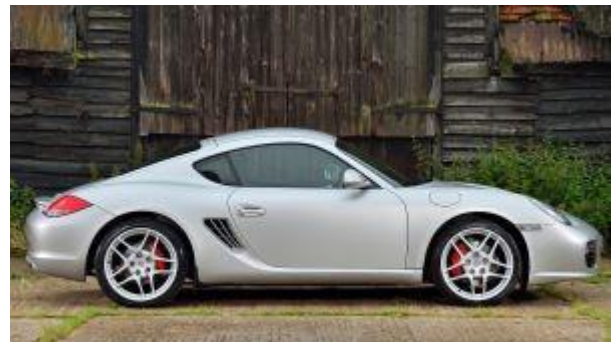
Cayman S 2005 – 2008