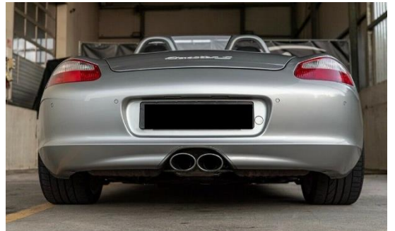
Boxster S 2009-2012 Gen 2