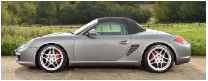
Boxster S 2002 - 2004