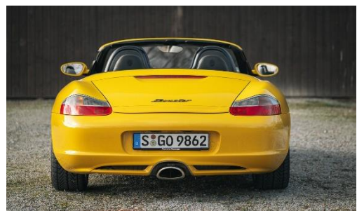
Boxster S 1997 - 2001