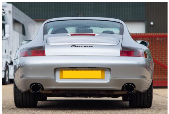
996 Carrera 2002 – 2004